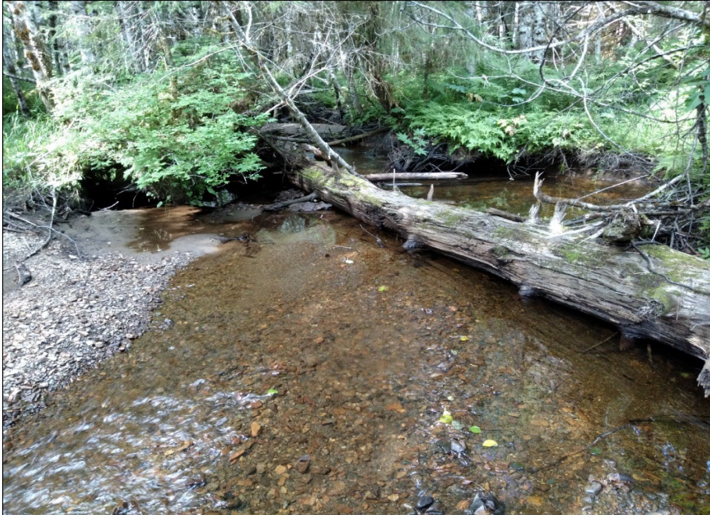
Figure 2. Downstream at waypoint 601.