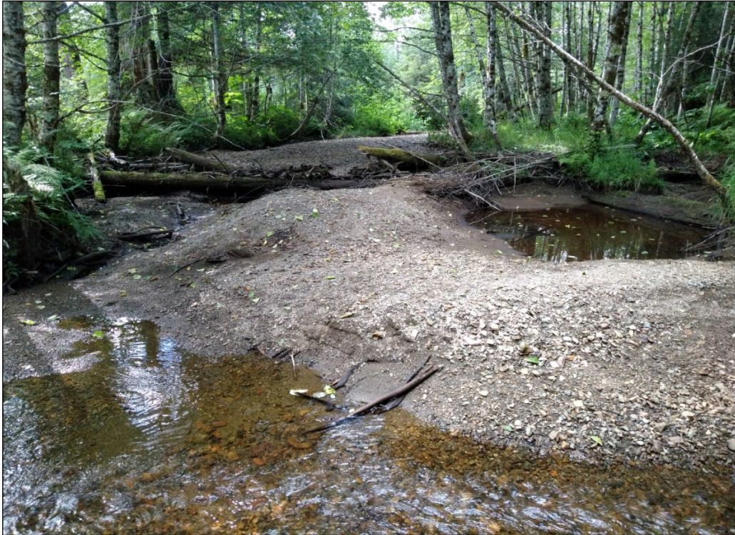
Figure 1. Upstream at waypoint 601.